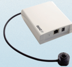
HS Series Features a Full HD Pinhole IP Camera (3.7mm - ZN1-V4FN4 or 2.8mm ZN1-V4FN4)